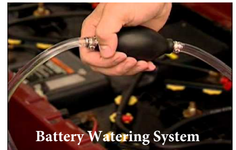
Battery Watering System

The soft vinyl enclosure is perfect for different types of weather.