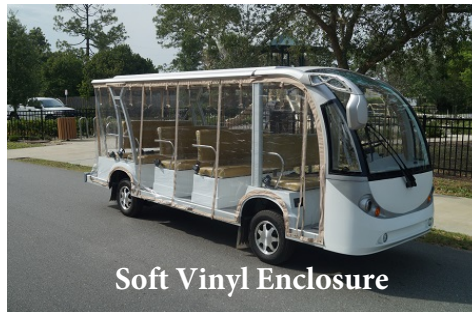
Soft Vinyl Enclosure

Keep the vehicle protected when not in use with one of our covers.